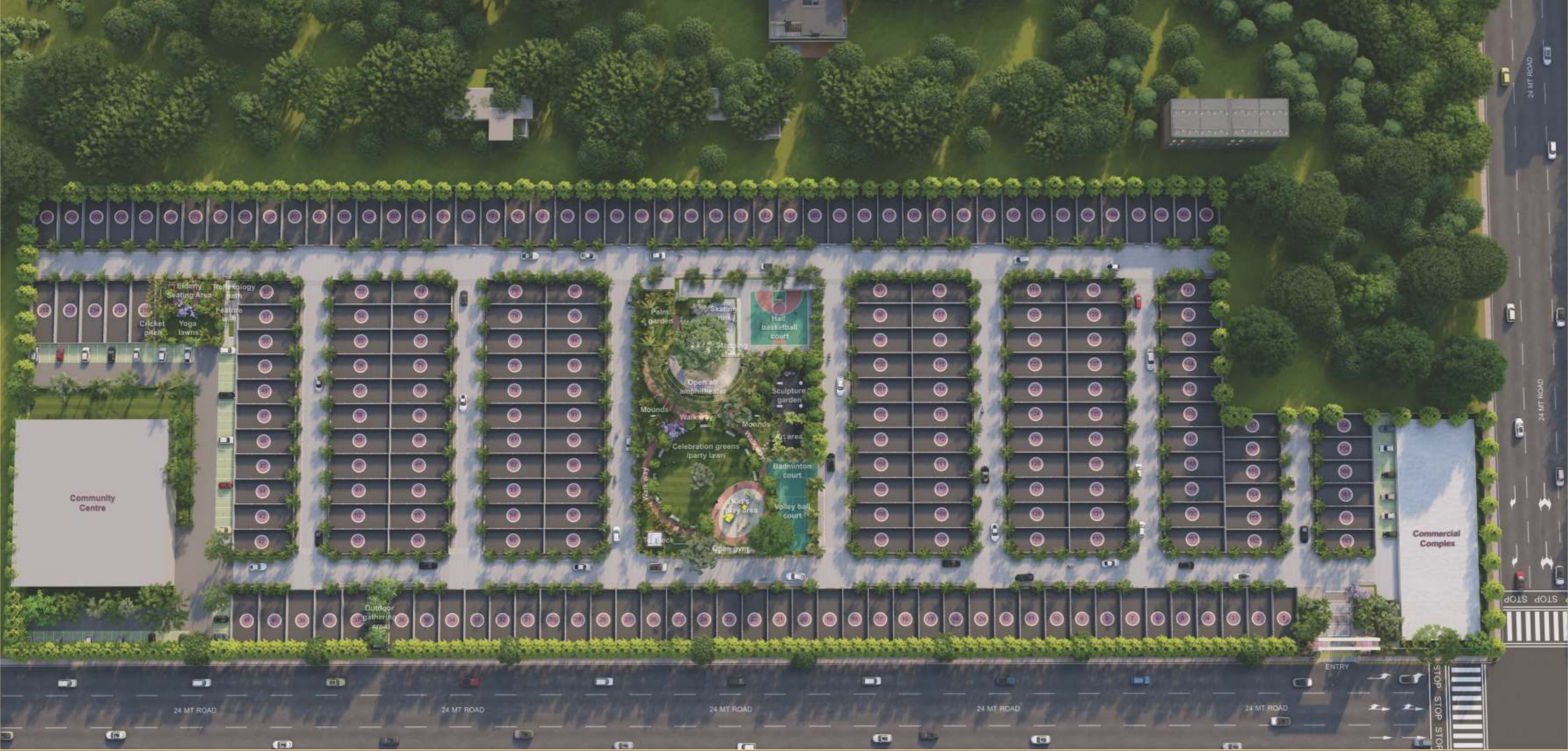
Designed by Mehta & Associates